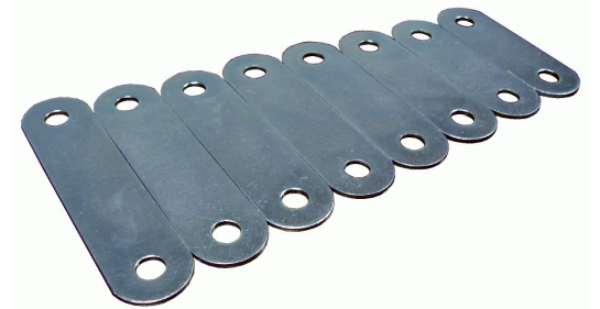
Xylophone Bars, CP0201 (Wood and hardware not included)

Whether you are a grandparent or parent making the xylophone for your youngster, or looking for a simple project to help initiate your aspiring percussionist to the loves of both music and woodworking, nothing could be more ideal.