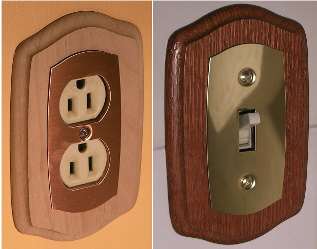
Duplex Receptacle Single Toggle

Using the included instructions & full size templates, make your own wall plate from your choice of solid wood; either contrasting to furniture present in the room, or matching it to perfection. Then set it off by adding one of three available Accent Plates available in a wide choice of finishes.