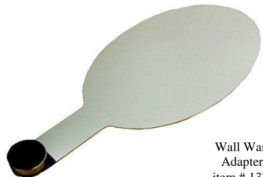
Wall Wash Adapter, item # 1377

Used with MR16 and smaller lamp sizes, the specular surface deflects nearly all the light. With larger lamp sizes, the light that is in the path of the adapter becomes deflected, leaving the remaining area as a downlight.